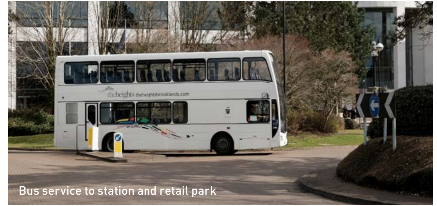
Bus service to station and retail park