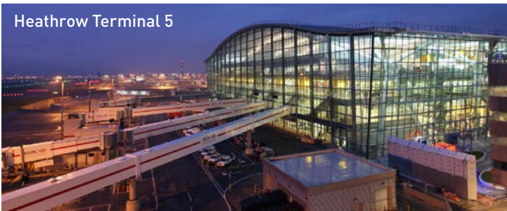
Heathrow Terminal 5

7 The Heights Brooklands Weybridge KT13 0XW