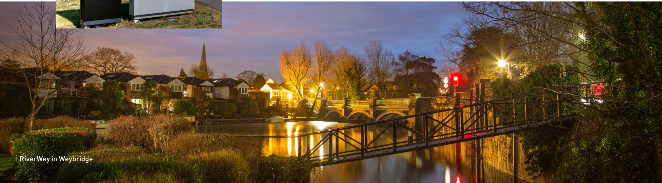
RiverWey in Weybridge